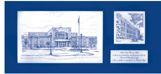
Combination New/Old Wausau East Print - $35