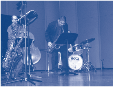
Starlight Music Masters Series

Wausau East High School – “Starlight Music Masters Series” - WSF grant funds supported seven events throughout the school year, highlighting talented individuals and groups in a variety of music performances, clinics, and master classes for students of all levels.