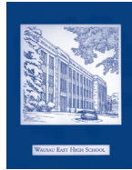
Wausau East High School (Pre-2004) Print - $25