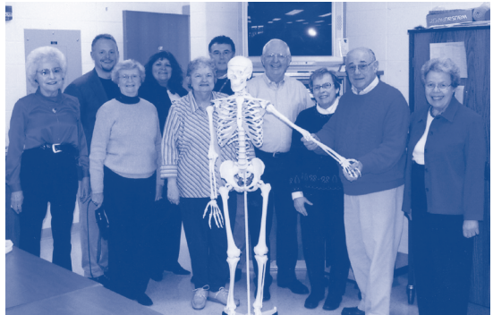
Members of Wausau High School Class of 1951

If your reunion class would like to be a part of investing in innovations for the Wausau School District or a specific education program, contact the Wausau School Foundation office at 715-261-0554.